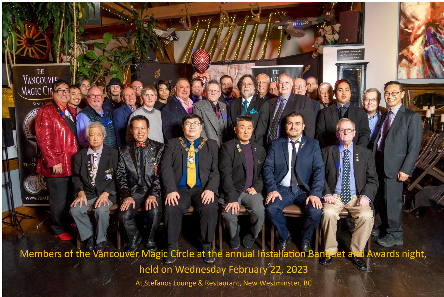
Members of the Vancouver Magic Circle at the annual Installation Banquet and Awards night, held on Wednesday February 22, 2023

At Stefanos Lounge & Restaurant, New Westminster, BC